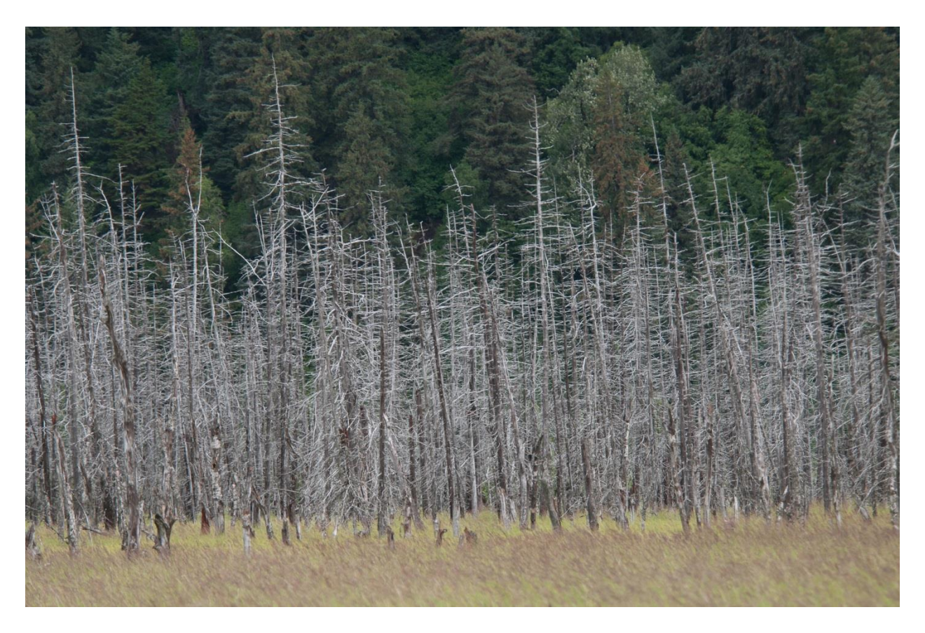
Figure 9. Forest killed by saltwater intrusion, Seward, Alaska. In this case, the saltwater incursion occurred as a result of an earthquake.

While inland systems that become inundated will increase in salinity, oceans themselves will experience reductions in salinity from the diluting effects of fresh glacial melt water. These chemical/density changes will alter ocean circulation and hence heat delivery and weather patterns inland; and will contribute further to sea-level fluctuation (Meehl et al. 2007; UNFCCC 2007). Sea-level rise also leads to coastal erosion (Hinzman et al. 2005), and Asia is particularly at risk. In addition to the complete loss of soil, forest habitat and land (Adger et al. 2001), this erosion increases carbon fluxes into the ocean itself (Hinzman et al. 2005), which has implications for the carbon cycle and atmospheric CO_2 enrichment.