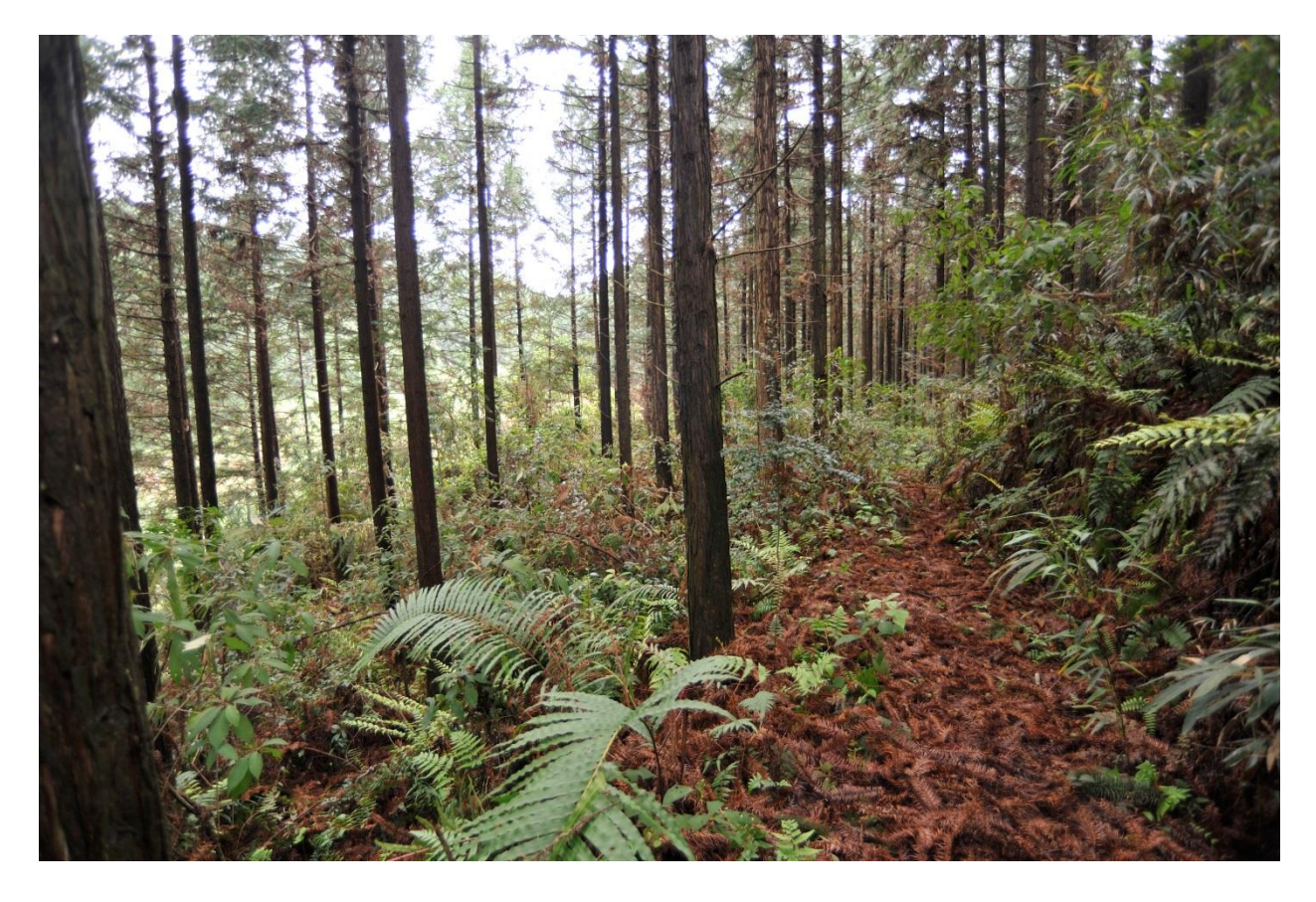
Figure 14. Chinese fir ( Cunninghamia lanceolata ) plantation in Fujian, China. Second and third rotations of Chinese fir often show productivity declines, a factor that may be related to the allelopathic effects of the litter.