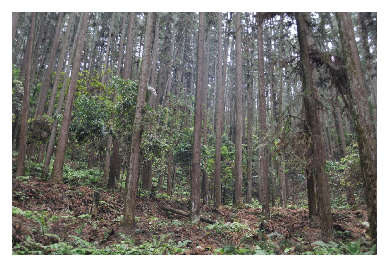
Figure 15. Experimental plantation of Chinese fir ( Cunninghamia lanceolata ), Fujian, China. Experimental plantations such as this provide important information on growth and yield trends in Chinese fir.

C. lanceolata may have a variety of responses to a changing climate and related stressors. Despite the wealth of research on this species' carbon storage capabilities, there is little information on how Chinese fir may respond to other factors such as increased temperature, drought, or niche-shifts associated with climate change. One study found the genetic diversity within Chinese fir populations to be linearly related to both temperature and altitude (Yeh et al. 1994), implying that genetic diversity within populations of this species may increase with climate change as temperatures increase and forests migrate to higher elevations.