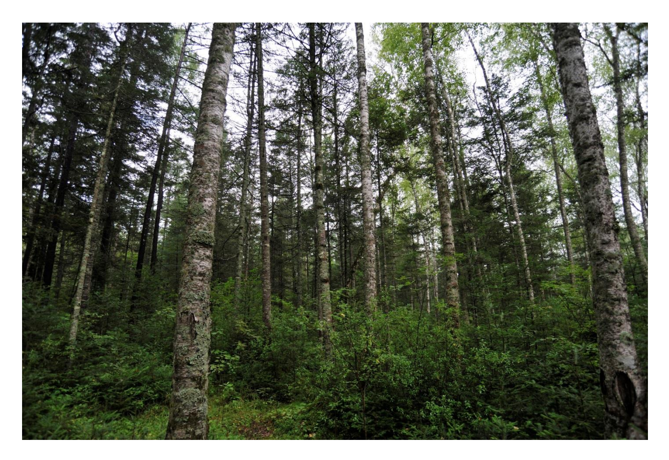
Figure 20. Boreal forest near Yichun, Heilongjiang Province, China. Such forests are under considerable anthropogenic pressure, increasing their vulnerability to climate change.