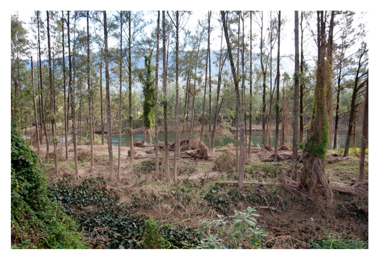
Figure 5. Flood damage to riverine forest, Bellinger River, New South Wales, Australia.

the nature and intensity of forest injury (Glenz et al. 2006). Most forest plants may quickly recuperate following a single flash flood that does not uproot vegetation, but repeated events will prevent that recovery. However, the flooding caused by sea level rise, as discussed in the following section, is more permanent and not as easily recovered from. In the northwest United States future flooding in forests is associated with changes in watershed hydrology brought on by milder winters (Hamlet and Lettenmaier 2007) rather than through an influx of excess moisture from rainfall or glacial melt.