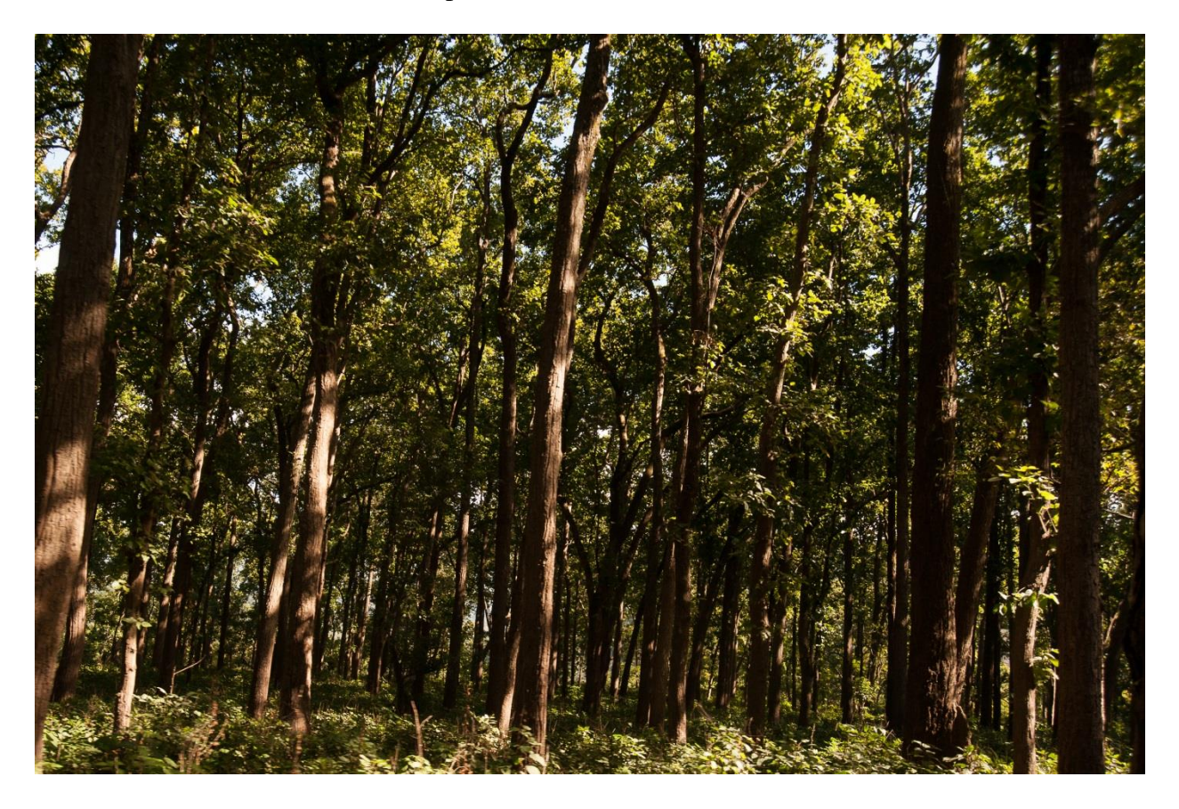
Figure 19. Sal ( Shorea robusta ) forest in the Himalayan foothills of northern India. This is an important timber species, and the rotation length used in forests has important implications for the amount of carbon that they store.

considered. In Australia, Turner and Lambert (2000) found that soil organic carbon stores were much lower in plantations than in the natural forests, and that surface soil carbon stores depleted rapidly within the first 12 years following plantation establishment. These lost soil carbon stores were eventually offset by vegetative carbon accumulation, however the rate at which carbon loss was offset differed substantially between stands. Canary et al. (2000) found that the fertilisation of Douglas-fir stands with urea increased total carbon storage by an average of 34.7 \text{ Mg} \cdot \text{C} \cdot \text{ha}^{-1} . However the risks associated with forest fertilisation, especially when combined with atmospheric organic nitrogen deposition, may outweigh the benefits of carbon sequestration and associated credits, in parts of the AP. Excess nitrogen leaches from soil systems into ground and surface water and can lead to soil and freshwater eutrophication or other undesirable environmental and human health impacts.