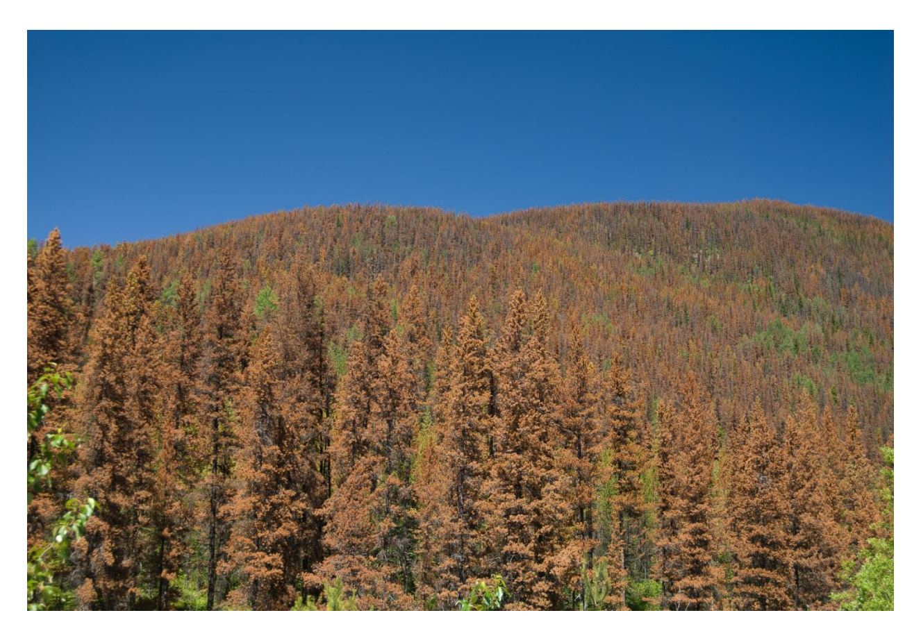
Figure 12. Damage to lodgepole pine ( Pinus contorta ) forests caused by the mountain pine beetle ( Dendroctonus ponderosae ), Barkerville, British Columbia, Canada. Over 18 million ha of forest in British Columbia have been affected by the outbreak, which has now spread to the neighbouring province of Alberta.