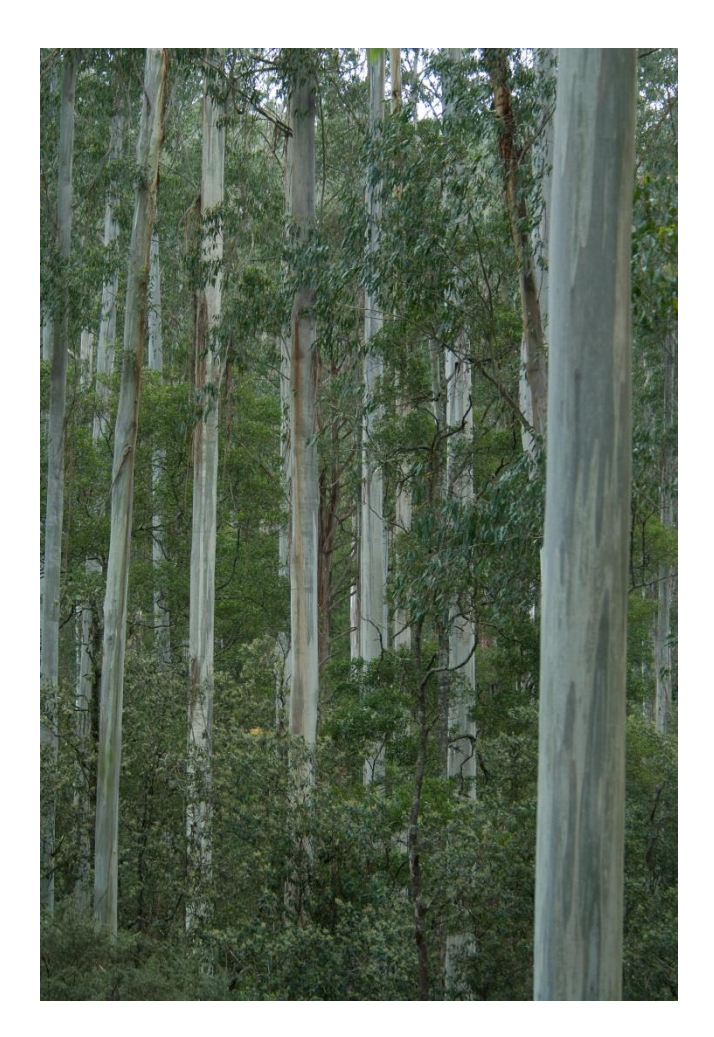
Figure 11. Mountain ash ( Eucalyptus regnans ) forest at Toorongo Forest, Victoria, Australia. Forests such as this have very large amounts of carbon stored above-ground.

Forests' carbon storage, carbon uptake, productivity, and responses to CO_2 enrichment are complex and interdependent. Many other elements of climate change affect how forests take up or release atmospheric carbon. For instance, boreal zones that have recently been damaged by wildfires can temporarily become sources of CO_2 due to the switch from primarily autotrophic to heterotrophic respiration, and a lack of primary productivity, as found in Northeast China (Wang et al. 2001). Reversals from forest carbon sequestration to forest carbon emissions have also been estimated in Western Canada following climate change induced forest mortality from a mountain pine beetle ( Dendroctonus ponderosae ) outbreak that turned a small carbon sink, into a significant carbon source (Kurz et al. 2008). Any cause of large-scale forest mortality is expected to cause the same reversal, leading to a positive climate change feedback when that mortality is climate-induced. Climate-induced disease outbreaks, drought, flooding and wind damage can all cause similar sink-to-source transitions in forests that may persist for many years. Fires themselves release the carbon stored in combusted biomass as atmospheric CO_2 , and Rapalee et al. (1998) reported that fire scars may be a net carbon source for up to 30 years following a burn.