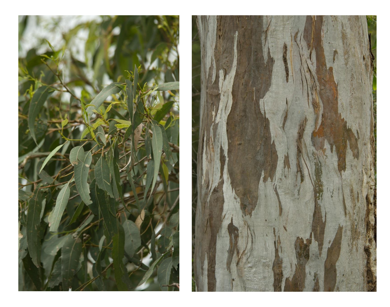
Figure 16. Forest red gum ( Eucalyptus tereticornis ), the subject of modelling studies of annual carbon storage potential.

In addition to numerous pine species, Douglas-fir ( Pseudotsuga menziesii ) is a commercially important species in western North America, particularly in British Columbia, Canada, and Washington and Oregon in the USA. At least two subspecies are known to exist; P. menziesii var. menziesi in coastal regions, and P. menziesii var. glauca in the continent's western interior region. P. menziesii may suffer from specific climate change-induced impacts. For instance, Apple et al. (2000) found (in a laboratory setting) that elevated temperature slightly, but significantly, increased stomatal conductance and transpiration in Douglas-fir, whereas elevated CO_2 did not significantly influence any aspect of needle morphology. Guak et al. (1998) found that elevated CO_2 and temperatures can advance the timing of bud burst, slow and reduce the growth of buds, and reduce the overall cold hardiness of Douglas-fir. The absence of cold winters can also drastically limit seedling establishment in this species (Shafer et al. 2001). However, Douglas-fir may also be capable of adapting to a modified climate via genotypic