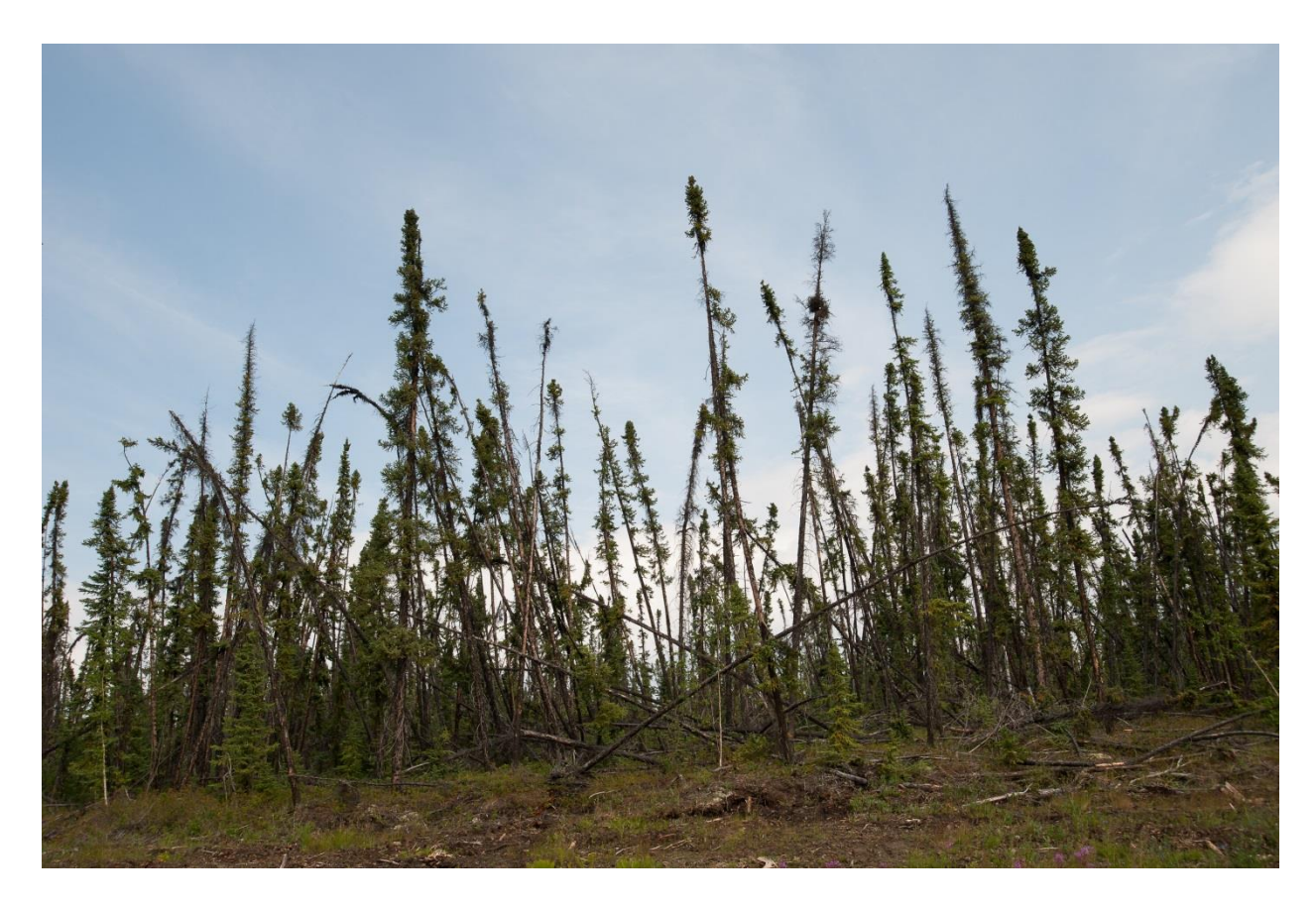
Figure 4. "Drunken forest" at Mayo, Yukon Territory, Canada, caused by melting permafrost. The unstable ground results in the trees losing their stability and falling over in different directions.