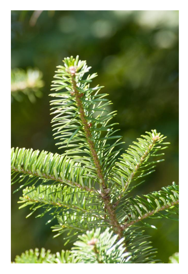
Figure 2. Korean fir ( Abies koreana ) in some areas has been reported to be suffering from water stress in its native habitat (Lim et al. 2008).