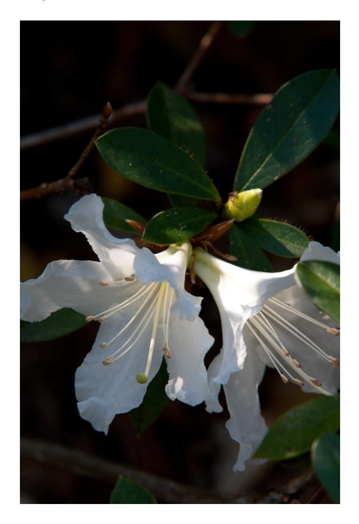
Figure 1. Species such as Rhododendron veitchianum , a primarily epiphytic species occurring at altitudes of 1200 – 2400 m in Myanmar, Laos and Thailand are vulnerable to climate change.

to those of forest and grassland (Preston et al. 2006). Alpine shifts in forests have already occurred in parts of the AP. Over the last century Siberia's forests have expanded by 20–60m in altitude into previous alpine tundra systems (Devi et al. 2008) due to shifts in climatic variables, and on Australia's Mt. Hotham Eucalyptus pauciflora has expanded to replace subalpine grasslands (Wearne and Morgan 2001). Similarly Southern California's dominant alpine plant species gained approximately 65 m in elevation from 1977–2007 (Kelly and Goulden 2008) and the forests of New Zealand began to display climate-induced shifts in altitude in the early 1990s (Wardle and Coleman 1992).