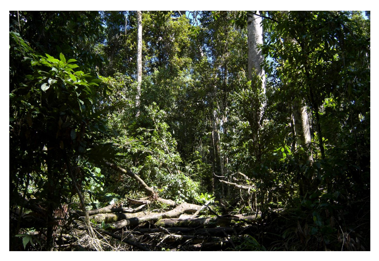
Figure 8. Hurricane damage to tropical rainforest, Atherton Tablelands, Queensland, Australia. The incidence of hurricanes may increase as a result of climate change, altering the disturbance dynamics of many forests.

Wind also influences vapour losses from forests and high winds may help to further the damaging effects of drought by increasing evapotranspirative losses. However increased wind-speeds over water bodies can increase the atmospheric moisture available for precipitation (Hubbard 1995) and help alleviate drought in forest areas near open water. The impact that increases in wind will have on the forests of the AP depends largely on the characteristics of a particular forest stand, its species, its moisture characteristics and the surrounding landscape and location (open water, exposed edges, etc.).