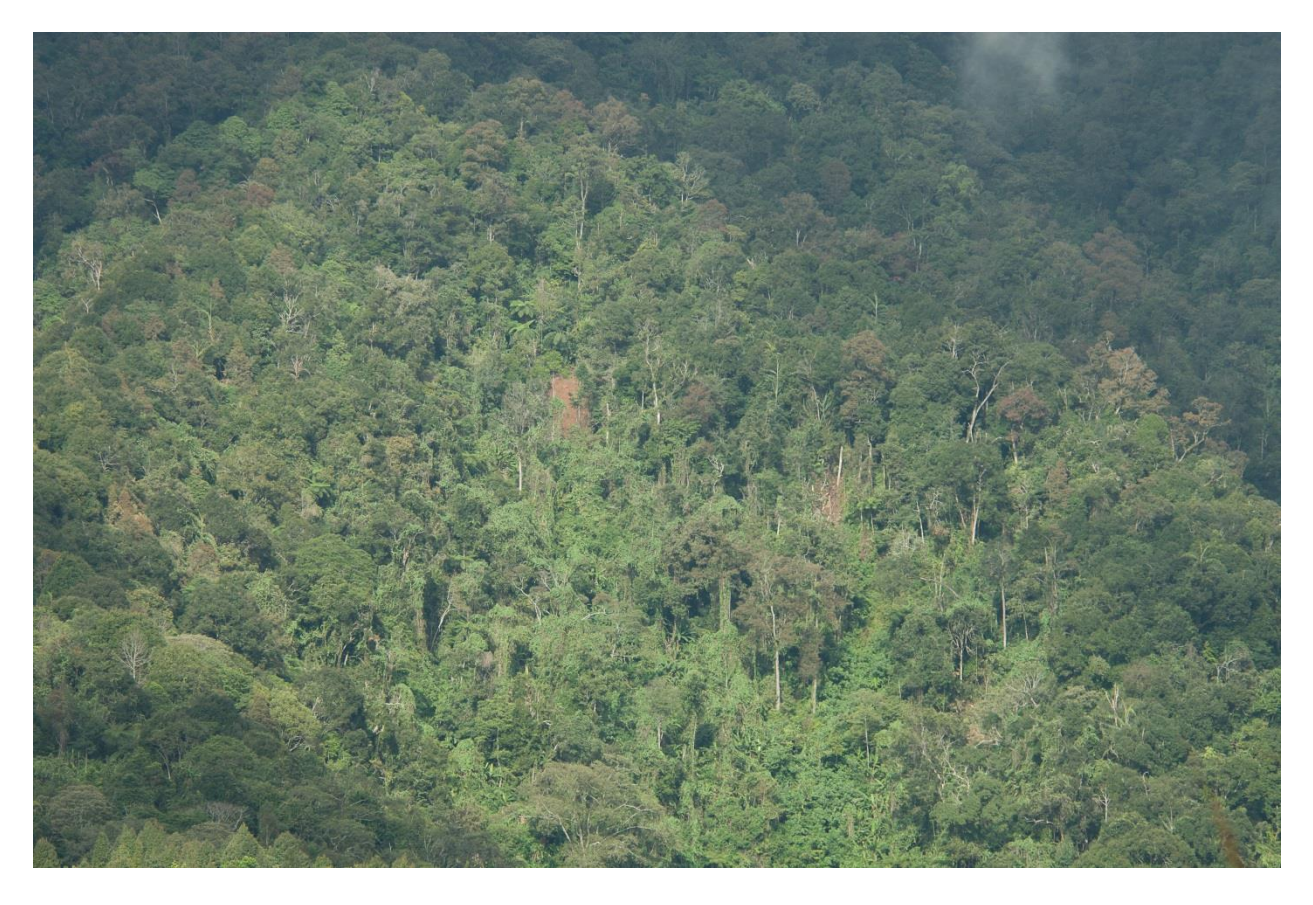
Figure 13. Upland evergreen rainforest, Java, Indonesia. Forests such as these are very dependent on cloud moisture; the incidence of cloud cover is changing in many parts of the tropics.

fine particles such as dust and soot (Kampa and Castanas 2008; Yang and Omaye 2009), these modes of mitigation are not recommended. However in many parts of the AP, SO<sub>2</sub> and other emissions are increasing – particularly in Asia (Ohara et al. 2007; Fowler et al. 2009) and western Canada (Environment Canada 2010). These and additional aerosol forming emissions such as NO_x and NH_4 may not only help to counteract surface heating, but increase cloud cover. This increased cloud cover is particularly important in tropical Asia, which faces a loss of montane cloud forests as a result of global climate change (Foster 2001).