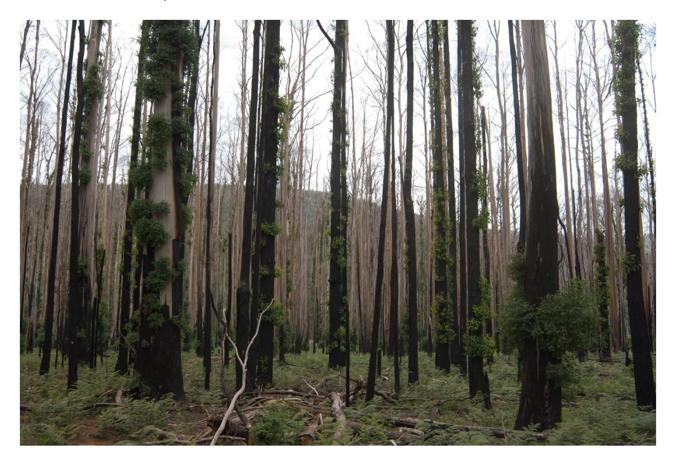
Figure 3. Fire damage to mixed eucalypt forest in the Murrindindi Valley, Victoria, Australia. This photograph was taken about 9 months after the fire (in February 2009) occurred and resprouting on some trees is already evident.

Forest fires may also select for forest species that regenerate (resprout) from coppice or rhizomes (Goto et al. 1996; Fensham et al 2003) rather than those that require seed germination, since seed banks are often destroyed in forest fires.