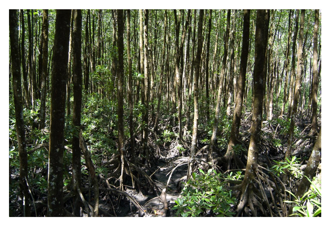
Figure 10. Mangrove forests, such as this one near Cairns, Queensland (Australia) may be vulnerable to rising sea-levels. The very fine species zonation within such forests suggests that each species has precise environmental requirements.