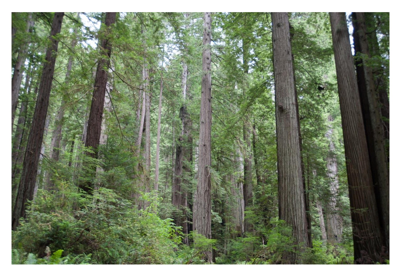
Figure 7. Coast redwoods ( Sequoia sempervirens ), such as these at the Hunnewell - Donald Memorial Grove in California, USA, may be very vulnerable to climate change because of their reliance on coastal fogs to supply moisture.