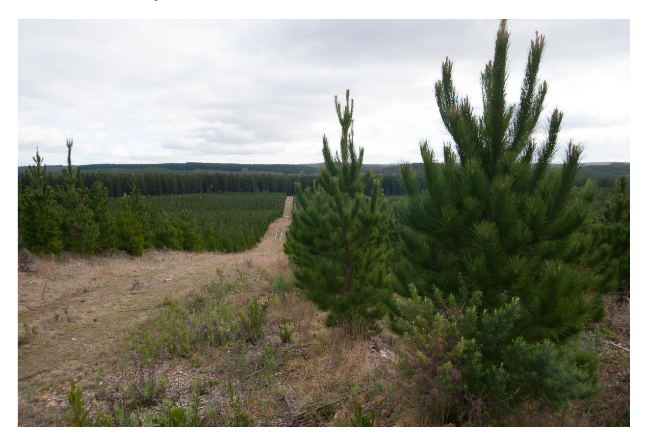
Figure 18. Radiata pine ( Pinus radiata ) plantation in the Wombat State Forest, Victoria, Australia. This species plays an important role in many temperate parts of the Asia-Pacific region, especially in Australia and New Zealand.

native forest stands (Turner and Lambert 2000). Radiata pine is usually grown in large monocultures, and is considered by some to be an invasive species due to changes (such as soil chemistry) it may cause in neighbouring native eucalypt systems (Baker and Murray 2012). Most pines are fast growing and therefore have substantial carbon storage potential under appropriate management regimes. Radiata pine is thought to have a competitive advantage in this regard, and due to its ability to adapt beyond its environmental niche, holds much promise for plantations in light of climate change. However, as Lavery and Mead (1998) point out, the limitations of this species are in the use of its products, and in its 'biologically safe growth environment' – i.e. so as not to threaten other species.